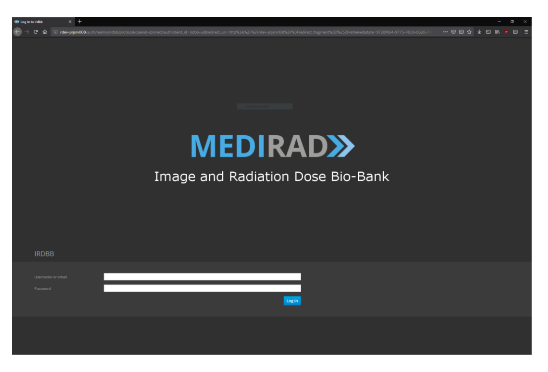
Figure 1: Authentication page

When connecting to the IRDBB-UI platform, the user shall authenticate using his/her credentials previously received by e-mail. Once authenticated, the user directly accesses to the IRDBB-UI application.